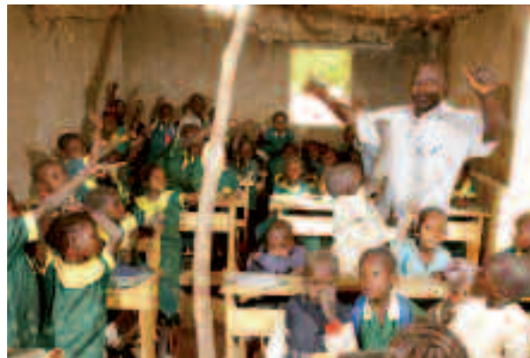
Children at a rural primary school

The Cameroon national football team, nicknamed Indomitable Lions is Africa's most successful side. They have qualified for the World Cup five times, more than any other African nation and they were the first African team to reach the quarter finals (in 1990), losing to England in extra time. They have also won 4 African Nation Cups as well as the gold medal at the 2000 Summer Olympics.