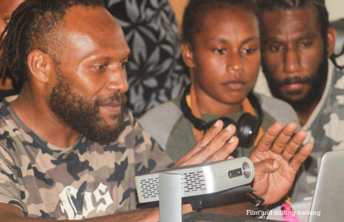
Film and editing training